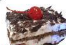
Black Forest Slice