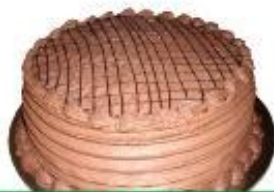
Italian Continental Supreme