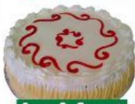
Jam & Cream Supreme