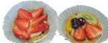
Strawberry & Fruit Tarts