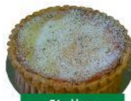
Italian Baked Ricotta