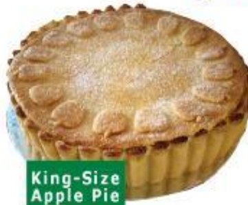
King-Size Apple Pie