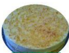
New York Cheesecake