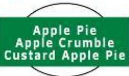
Apple Pie Apple Crumble Custard Apple Pie