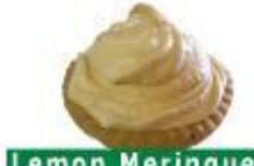
Lemon Meringue Tart