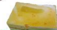
Mad Mango Slice