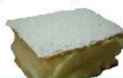
Italian Vanilla Slice