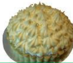
Hawaiian Meringue Pie